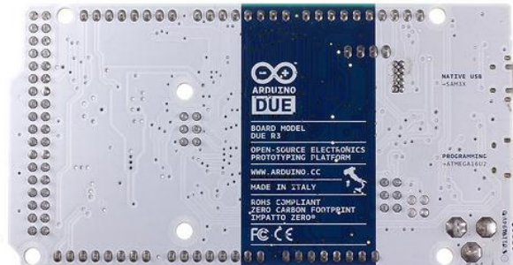
Arduino Due Back