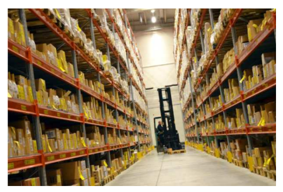
Warehouse / Logistics

Monitors the temperature and humidity distributions on a floor, and feeds them back to air conditioners.