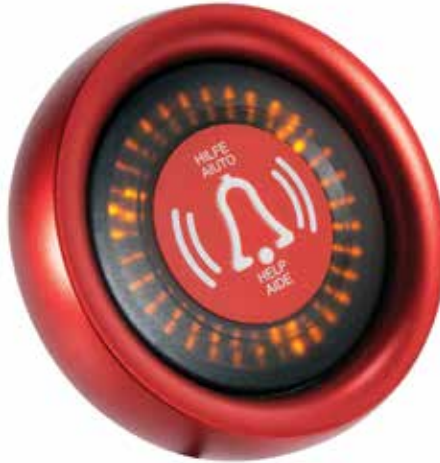
Attention to detail: the Series 57 Emergency-call button features protective bezel to prevent accidental operation.

“HMI specialists like EAO encourage the consideration of several key areas: ergonomics, health and safety, performance, and the presentation of information.”