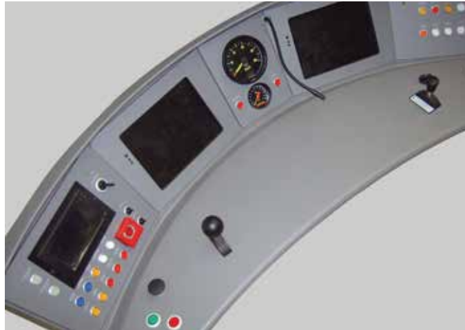
The placement of components, screens, switch configuration, protection guards and other ergonomic factors improve usability and safety.

“Stringent regulations within the public transportation industry require HMI components that meet the highest standards of safety, durability, and functionality.”