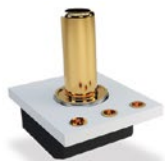
Bourns® Model BPS130 Single Port