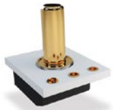
Bourns® Model BPS130 Single Port