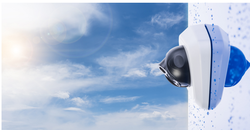
Outdoor applications such as CCTV cameras often require a Peltier cooling solution.

In addition to thermal requirements, assembly considerations play a role when optimizing for an efficient cooling solution. For example, outgassing is not acceptable because it can coat the imaging sensor optics. It is therefore vital to properly select thermal interface materials between the thermoelectric cooler and CMOS sensor with low outgas characteristics or substitute interface material, all together with a pre-tin solder on hot and cold surfaces of the thermoelectric cooler. Design considerations need to be made to minimize thermal shorting. This occurs when cold side surfaces come in contact with hot side surfaces which causes the thermoelectric cooler to draw more current to achieve the same cooling performance.