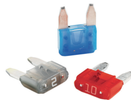
MINI® Series Blade Fuses Fuses sold separately