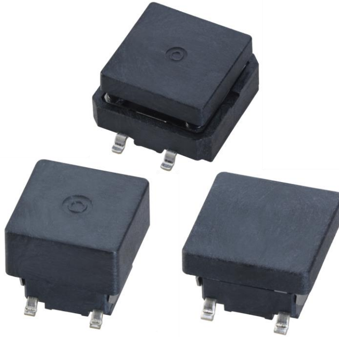
Surface mount tactile switch with integrated keytops