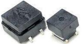
B3FS1: □6mm B3FS4: □12mm (Main body)