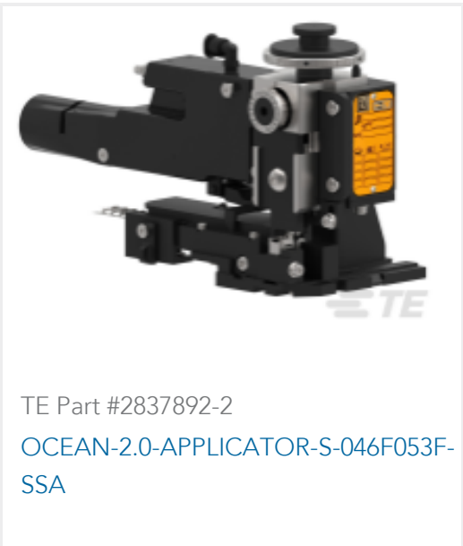
TE Part #2837892-2 OCEAN-2.0-APPLICATOR-S-046F053F-SSA