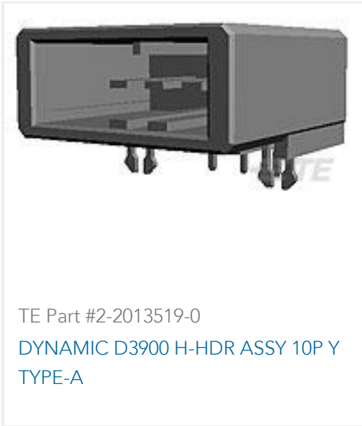
TE Part #2-2013519-0 DYNAMIC D3900 H-HDR ASSY 10P Y TYPE-A