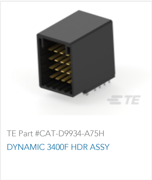
TE Part #CAT-D9934-A75H DYNAMIC 3400F HDR ASSY