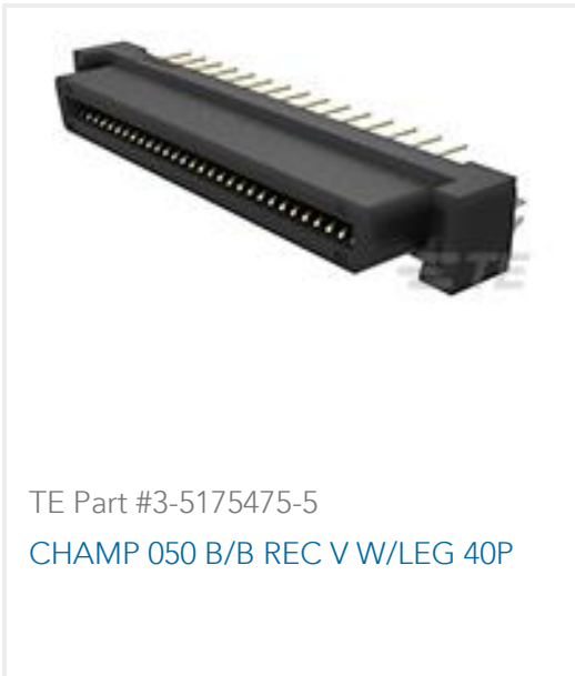
TE Part #3-5175475-5 CHAMP 050 B/B REC V W/LEG 40P