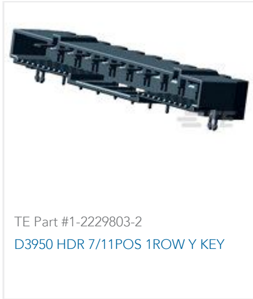
TE Part #1-2229803-2 D3950 HDR 7/11POS 1ROW Y KEY