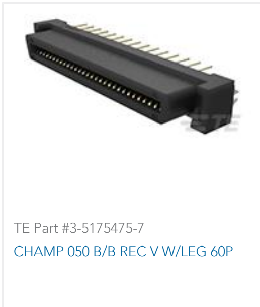
TE Part #3-5175475-7 CHAMP 050 B/B REC V W/LEG 60P