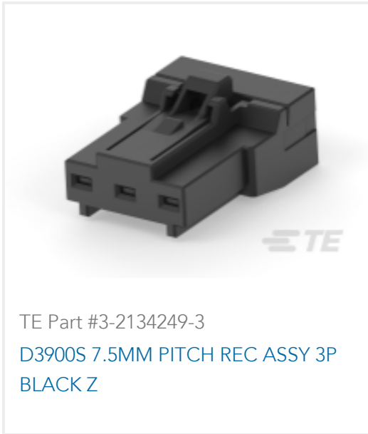
TE Part #3-2134249-3 D3900S 7.5MM PITCH REC ASSY 3P BLACK Z