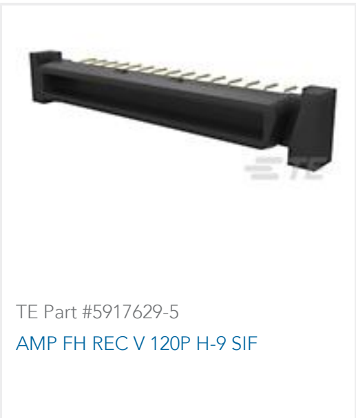
TE Part #5917629-5 AMP FH REC V 120P H-9 SIF