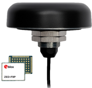
TW5384 Smart GNSS Antenna