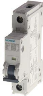
Miniature circuit breaker 240 V 14kA, 1-pole, C, 13 A, D=70 mm according to UL 489, equal polarity