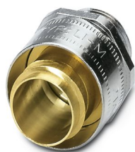
Cable gland made from brass with metric thread, rotatable, IP40 protection

Please be informed that the data shown in this PDF document is generated from our online catalog. Please find the complete data in the user documentation. Our general terms of use for downloads are valid.