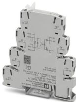
PLC-INTERFACE, integrated solid-state relay, with screw connection, for mounting on NS 35/7,5 DIN rails, input: 220 V DC, output: 12 - 300 V DC/1 A

Please be informed that the data shown in this PDF document is generated from our online catalog. Please find the complete data in the user documentation. Our general terms of use for downloads are valid.