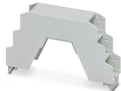
DIN rail housing, Upper housing part for connectors with header, width: 22.6 mm, height: 102 mm, depth: 60.15 mm, color: light gray (similar RAL 7035)

Please be informed that the data shown in this PDF document is generated from our online catalog. Please find the complete data in the user documentation. Our general terms of use for downloads are valid.