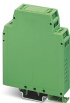
Electronic housing, double-level, fully equipped with 6 screw connections per side for one printed circuit board

Please be informed that the data shown in this PDF document is generated from our online catalog. Please find the complete data in the user documentation. Our general terms of use for downloads are valid.