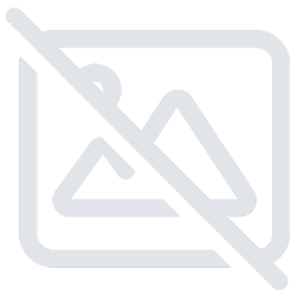
VARIOFACE front adapter, for Schneider Electric Modicon 984 series 800, output card B838

Please be informed that the data shown in this PDF document is generated from our online catalog. Please find the complete data in the user documentation. Our general terms of use for downloads are valid.