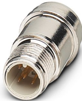
Device connector rear mounting, Universal, 5-position, Pin, straight, M12, A-coding, Solder pins

Please be informed that the data shown in this PDF document is generated from our online catalog. Please find the complete data in the user documentation. Our general terms of use for downloads are valid.