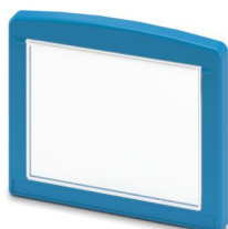
Housing frame, Latching cover (non-detachable), color: blue (similar RAL 5015)

Please be informed that the data shown in this PDF document is generated from our online catalog. Please find the complete data in the user documentation. Our general terms of use for downloads are valid.