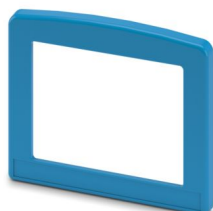
Housing frame, Design element with marking field, color: blue (similar RAL 5015)

Please be informed that the data shown in this PDF document is generated from our online catalog. Please find the complete data in the user documentation. Our general terms of use for downloads are valid.