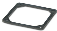
Flat gasket for flange

Please be informed that the data shown in this PDF document is generated from our online catalog. Please find the complete data in the user documentation. Our general terms of use for downloads are valid.