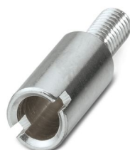
Test plug strip, color: silver-colored

Please be informed that the data shown in this PDF document is generated from our online catalog. Please find the complete data in the user documentation. Our general terms of use for downloads are valid.