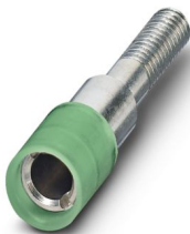
Test plug strip, number of positions: 1, color: green

Please be informed that the data shown in this PDF document is generated from our online catalog. Please find the complete data in the user documentation. Our general terms of use for downloads are valid.