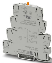
PLC-RELAY with integrated switch (actuation: Manual) with screw connection, for mounting on DIN rail NS 35/7.5, input voltage ≤ 72 V DC

Please be informed that the data shown in this PDF document is generated from our online catalog. Please find the complete data in the user documentation. Our general terms of use for downloads are valid.