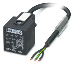
Sensor/actuator cable, 3-position, PVC, black, free cable end, on Valve connector A, with 1 LED

Please be informed that the data shown in this PDF document is generated from our online catalog. Please find the complete data in the user documentation. Our general terms of use for downloads are valid.