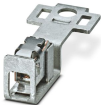
PE adapter with PT connection, for 1 PE connection, for HC-B/HC-BB/HC-DD/HC-D40/HC-D64/HC-HV/HC-BBB, and HC-K contact inserts

Please be informed that the data shown in this PDF document is generated from our online catalog. Please find the complete data in the user documentation. Our general terms of use for downloads are valid.