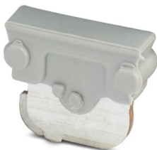
Feed-through connector, width: 4 mm, height: 10.5 mm, color: gray

Please be informed that the data shown in this PDF document is generated from our online catalog. Please find the complete data in the user documentation. Our general terms of use for downloads are valid.