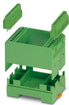
Electronic housing set, consisting of electronic module and printed circuit termination blocks, pitch 5

Please be informed that the data shown in this PDF document is generated from our online catalog. Please find the complete data in the user documentation. Our general terms of use for downloads are valid.