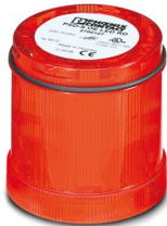
LED permanent light element, 24 V AC/DC, red

Please be informed that the data shown in this PDF document is generated from our online catalog. Please find the complete data in the user documentation. Our general terms of use for downloads are valid.