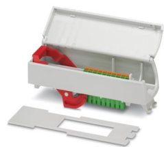
Connection technology carrier, fully assembled with FKCN 2x 10-pos., cover and release lever, incl. fitted cover, corresponding header: 1x CCDN 2,5/10-G1 P26 THR (1734355)

Please be informed that the data shown in this PDF document is generated from our online catalog. Please find the complete data in the user documentation. Our general terms of use for downloads are valid.