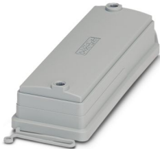
Protective cover B24, Clip locking, protective cover material: PA, height: 31.2 mm, seal: no, with lanyard

Please be informed that the data shown in this PDF document is generated from our online catalog. Please find the complete data in the user documentation. Our general terms of use for downloads are valid.