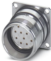
M23, Device connector rear mounting, series: RC, straight, shielded: yes, Screw locking mechanism, Radial O-ring, Panel thickness min.: 2.7 mm, Panel thickness max.: 3.5 mm

Please be informed that the data shown in this PDF document is generated from our online catalog. Please find the complete data in the user documentation. Our general terms of use for downloads are valid.