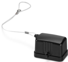
Protective cover M1, for single locking latch, protective cover material: PC, height: 26.1 mm, seal: no, for panel-mount base

Please be informed that the data shown in this PDF document is generated from our online catalog. Please find the complete data in the user documentation. Our general terms of use for downloads are valid.