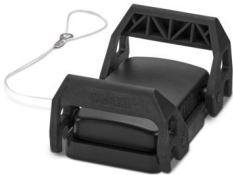
Protective cover D50, with double locking latch, protective cover material: PC, height: 29 mm, seal: yes

Please be informed that the data shown in this PDF document is generated from our online catalog. Please find the complete data in the user documentation. Our general terms of use for downloads are valid.