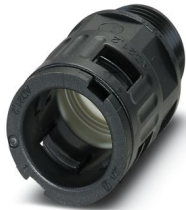
Cable gland, Pg thread, IP68/69k protection, straight

Please be informed that the data shown in this PDF document is generated from our online catalog. Please find the complete data in the user documentation. Our general terms of use for downloads are valid.