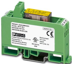
Safe coupling relay with force-guided contacts, 2 changeover contacts, 1-channel, fixed screw terminal block, width: 17.5 mm

Please be informed that the data shown in this PDF document is generated from our online catalog. Please find the complete data in the user documentation. Our general terms of use for downloads are valid.