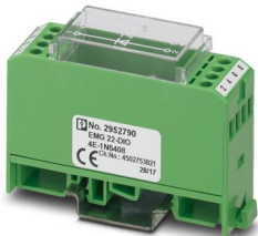
Diode module, with 4 diodes, individually wired, diode type 1N 5408

Please be informed that the data shown in this PDF document is generated from our online catalog. Please find the complete data in the user documentation. Our general terms of use for downloads are valid.