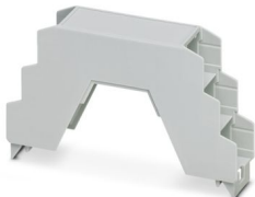
DIN rail housing, Upper housing part for connectors with header, width: 22.6 mm, height: 102 mm, depth: 60.15 mm, color: light gray (similar RAL 7035)

Please be informed that the data shown in this PDF document is generated from our online catalog. Please find the complete data in the user documentation. Our general terms of use for downloads are valid.