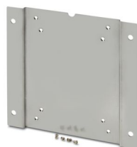
Mounting plate for FL SWITCH 30... and FL SWITCH 40... 16-port switches

Please be informed that the data shown in this PDF document is generated from our online catalog. Please find the complete data in the user documentation. Our general terms of use for downloads are valid.