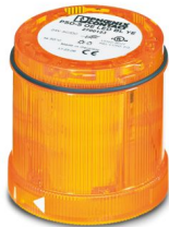
LED flashing light element, 24 V AC/DC, yellow

Please be informed that the data shown in this PDF document is generated from our online catalog. Please find the complete data in the user documentation. Our general terms of use for downloads are valid.