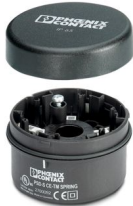
Connection element with spring-cage terminal blocks for tube mounting

Please be informed that the data shown in this PDF document is generated from our online catalog. Please find the complete data in the user documentation. Our general terms of use for downloads are valid.