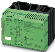
Three-phase solid-state reversing contactor with 230 V AC input, 16 A output current, zero voltage switch, optionally with thermal fuse

Please be informed that the data shown in this PDF document is generated from our online catalog. Please find the complete data in the user documentation. Our general terms of use for downloads are valid.