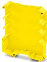
DIN rail housing, Housing half shell (right), tall design, without vents, width: 16.3 mm, height: 99 mm, depth: 112.85 mm, color: yellow (similar RAL 1018), cross connection: DIN rail bus connector (optional)

Please be informed that the data shown in this PDF document is generated from our online catalog. Please find the complete data in the user documentation. Our general terms of use for downloads are valid.