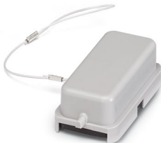
Protective cover D15, for single locking latch, protective cover material: PA, height: 20.5 mm, seal: yes, with lanyard

Please be informed that the data shown in this PDF document is generated from our online catalog. Please find the complete data in the user documentation. Our general terms of use for downloads are valid.