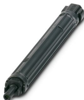
Fuse connector for protecting modules and devices in photovoltaic systems, black, SUNCLIX pin connector pattern, 1500 V/8 A, IP68 (24 h/2 m)

Please be informed that the data shown in this PDF document is generated from our online catalog. Please find the complete data in the user documentation. Our general terms of use for downloads are valid.