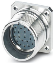
Device connector front mounting, number of positions: 26

Please be informed that the data shown in this PDF document is generated from our online catalog. Please find the complete data in the user documentation. Our general terms of use for downloads are valid.