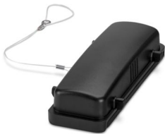
Protective cover B24, for double locking latch, protective cover material: PC, height: 26.3 mm, seal: yes

Please be informed that the data shown in this PDF document is generated from our online catalog. Please find the complete data in the user documentation. Our general terms of use for downloads are valid.