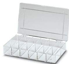
Assortment box, dimensions: 210 x 105 x 36 mm, 12 compartments, compartment size: 57 x 32 mm

Please be informed that the data shown in this PDF document is generated from our online catalog. Please find the complete data in the user documentation. Our general terms of use for downloads are valid.