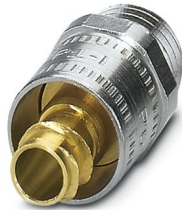
Cable gland made from brass with Pg thread, rotatable, IP40 protection

Please be informed that the data shown in this PDF document is generated from our online catalog. Please find the complete data in the user documentation. Our general terms of use for downloads are valid.