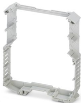
DIN rail housing, Intermediate element, tall design, with vents, width: 17.6 mm, height: 99 mm, depth: 112.85 mm, color: light gray (similar RAL 7035)

Please be informed that the data shown in this PDF document is generated from our online catalog. Please find the complete data in the user documentation. Our general terms of use for downloads are valid.