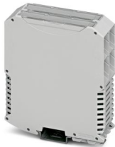
DIN rail housing, Complete housing with metal foot catch, tall design, with vents, width: 35.2 mm, height: 99 mm, depth: 113.65 mm, color: light gray (similar RAL 7035), cross connection: DIN rail bus connector (optional), number of positions cross connector: 5

Please be informed that the data shown in this PDF document is generated from our online catalog. Please find the complete data in the user documentation. Our general terms of use for downloads are valid.