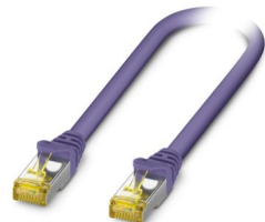
Patch cable, RJ45/IP20 straight on RJ45/IP20 straight, cable length: 0.3 m, number of positions: 8, 10 Gbps, CAT6 A , connection cross section: AWG 26- 26, Ethernet, 4x2xAWG26/7; S/FTP, violet

Please be informed that the data shown in this PDF document is generated from our online catalog. Please find the complete data in the user documentation. Our general terms of use for downloads are valid.